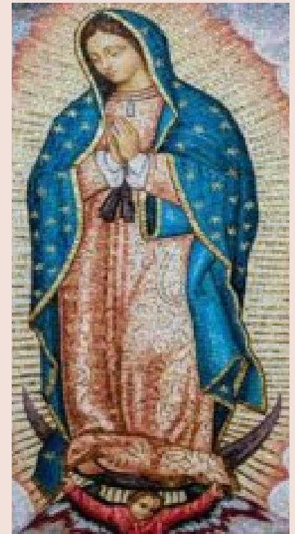
Silver Rose Ceremony