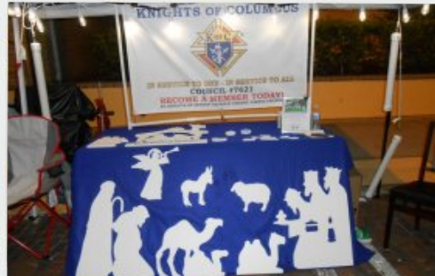
2nd First Friday